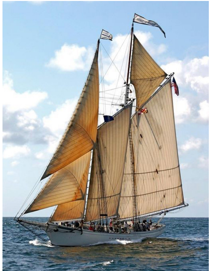
The Spirit of Massachusetts

For those of you who would like to see the Spirit of Massachusetts again you'll find her moored in Kennebunk, Maine. She was restored and retired from service in 2014 and is now a restaurant serving cocktails and small plates. I'm sure you won't have to wash dishes this time in the galley.