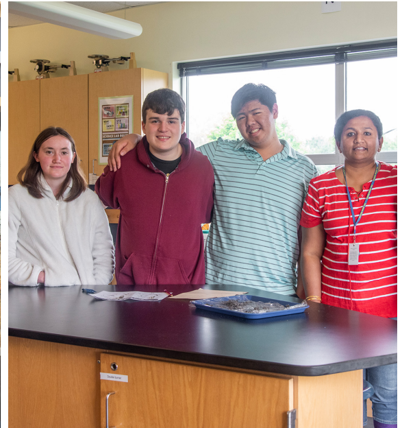
Orrstown Bank has been a generous EITC donor since 2015